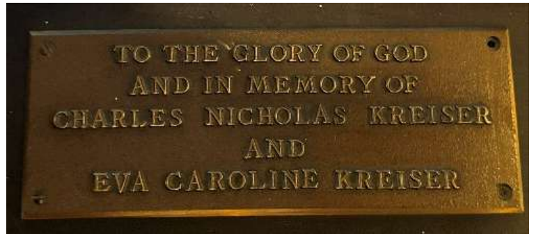
Plate below the window