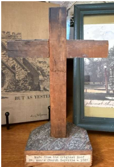
Wooden cross made from the original roof of Saint Ann's Church in 1887