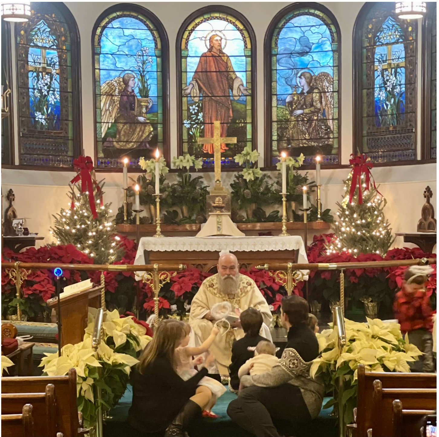
Christmas Eve 4 pm Family Service